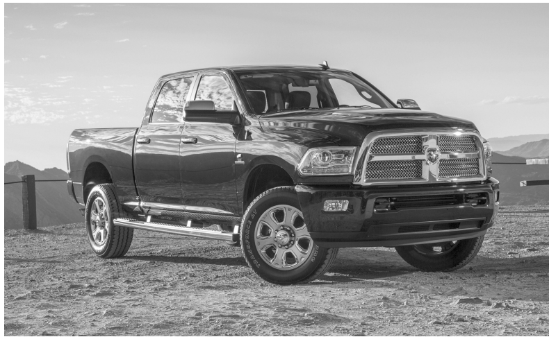
The popular automotive website Edmunds.com has named five Chrysler Group vehicles as award winners. The 2014 Ram 1500 full-size and 2500 heavy-duty pickups (shown here) were named "Top Rated Vehicles on Edmunds.com" during the 2014 New York International Auto Show press days.

Ram 2500 - The 2014 Ram 2500 adds new powertrain, suspension and innovative features that deliver the most powerful, capable and comfortable heavy-duty truck in the segment. Ram's Heavy Duty line offers an all-new 6.4-liter HEMI V-8 with best-in-class (gas engine) 410 horsepower and 429 lb.-ft. of torque, a 5.7-liter HEMI V-8 and the renowned 6.7-liter Cummins Turbo Diesel I-6, cranking out 370 horsepower and best-in-class (diesel engine) 800 lb.-ft. of torque. An all-new five-link coil rear suspension system, with an available exclusive rear air suspension, allows for best-in-class ride and handling. The two robust options meld with a new front suspension to handle the best-in-class 17,970 lb. towing capacity. Innovative features such