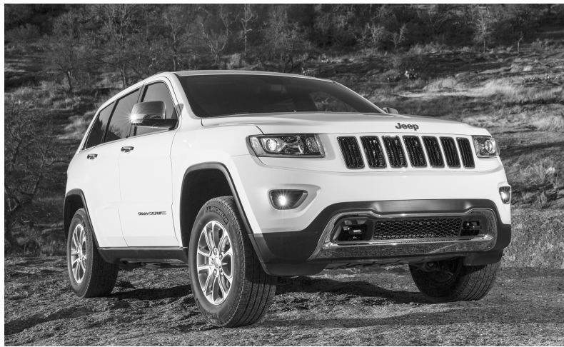
Jeep Grand Cherokee (shown here) and Dodge Grand Caravan, the most awarded SUV and minivan ever, were listed as the "2014 Most Popular on Edmunds.com" vehicles in the Midsize Traditional SUV and Minivan categories, respectively.

as a cargo bed camera, 5th wheel/gooseneck trailer prep package and the popular Uconnect system come together to offer customers the best ¾-ton truck in the segment.